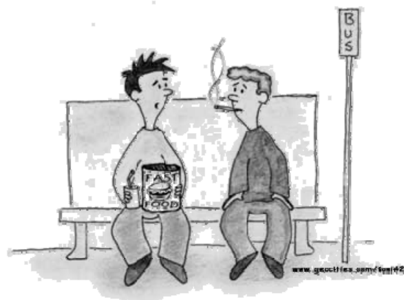
"Don't you know how bad those things are for you?"